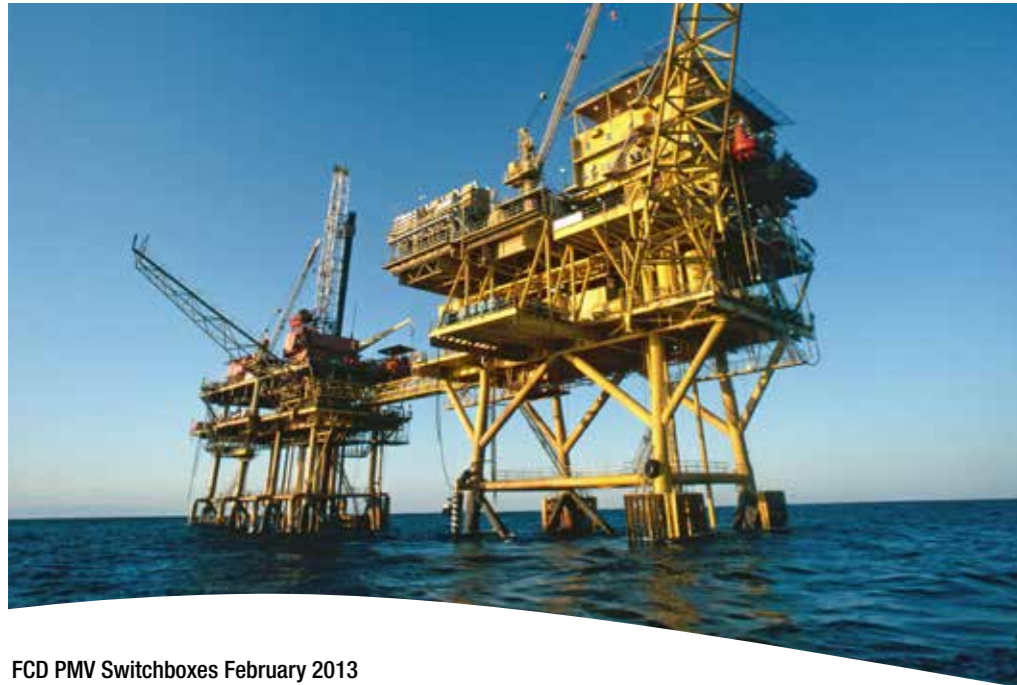
FCD PMV Switchboxes February 2013